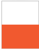
1/2 page 205x135,7 + 5 mm bleed